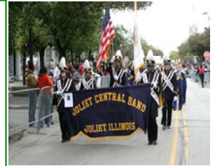
Joliet Central Band