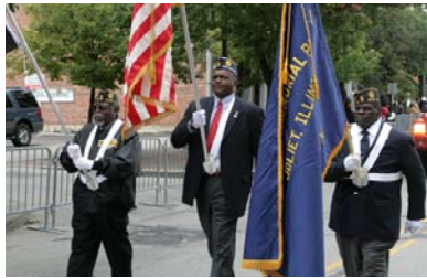
Buffalo Soldiers: Joliet Illinois