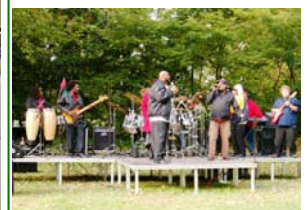
Smooth & Silk Entertainment