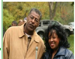
Black Pride Event Commentators