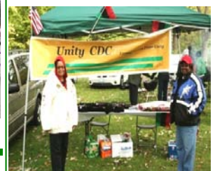
Unity CDC: Black Pride Event Coordinators