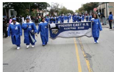
2009 Black Pride Band Winner: Proviso East