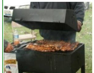
Black Pride Picnic: BBQ Cooking Contest