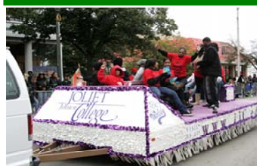
2009 Black Pride Float Winner: Joliet Junior