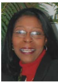
Bettye Gavin Center for Working