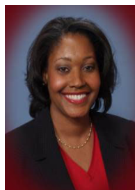
Cathe Evans-Williams Corporate Council