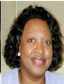
Tempie Bates Harvey Brooks Foundation