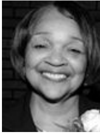
Councilwoman Susie Barber District 4