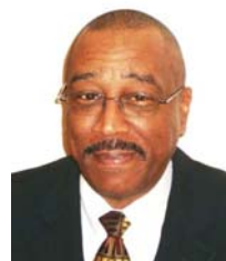
Mac Willis Neighborhood Council