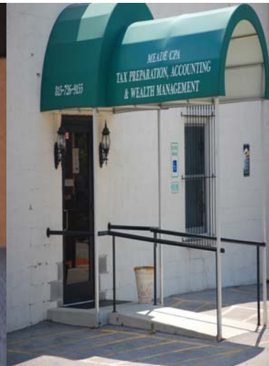
205 E Clinton Suite 3